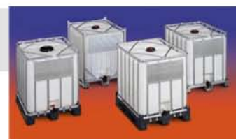
1150 kg / IBC